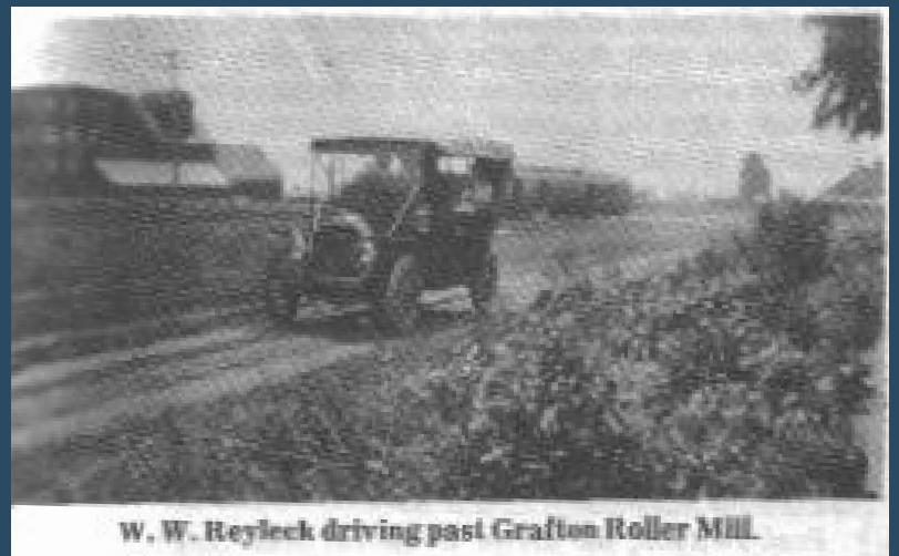
W. W. Reyleck driving past Grafton Roller Mill.