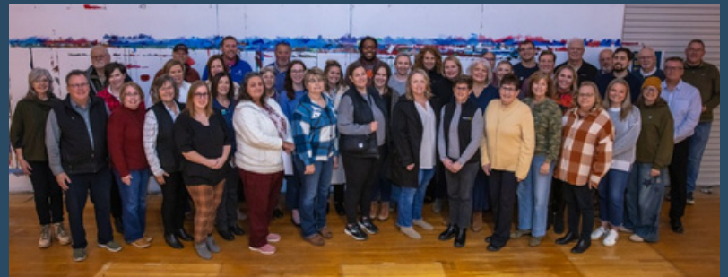
November 2025 Partner Event