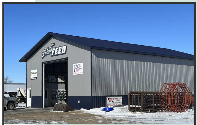
The new Lakota Feed warehouse.

Lakota Feed requested financing for a new warehouse to store animal feed and supplies. The Nelson County JDA, in partnership with the City of Lakota, provided funds for the required local portion of interest buydown under the Bank of North Dakota (BND) Flex Pace Loan Program. The State Bank of Lakota is the lender for the project.