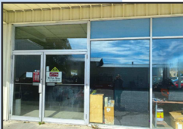
Wallace Repair, McVile