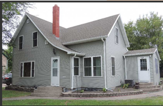
After: New siding, shingles, windows, and doors

By focusing on the preservation, maintenance, and improvement of the existing housing stock, this project will assist in addressing an important piece of community vitality in Nelson County.